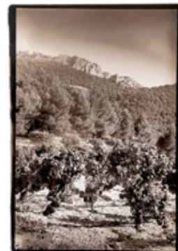
Domaine Les Pallières vineyard in Gigondas.